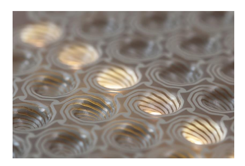
Stretchable material for formed & in-molded electronics.