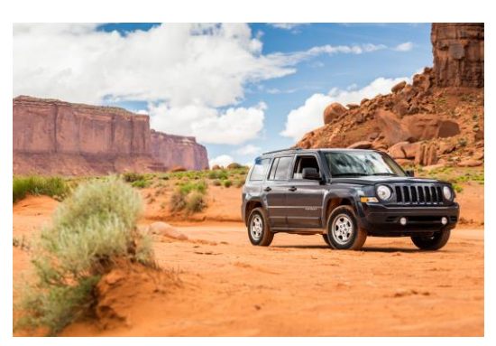
FCA US LLC counts on solutions from Henkel Adhesive Technologies in the production of its models Jeep Patriot, Jeep Compass, Dodge Dart and Chrysler 200.