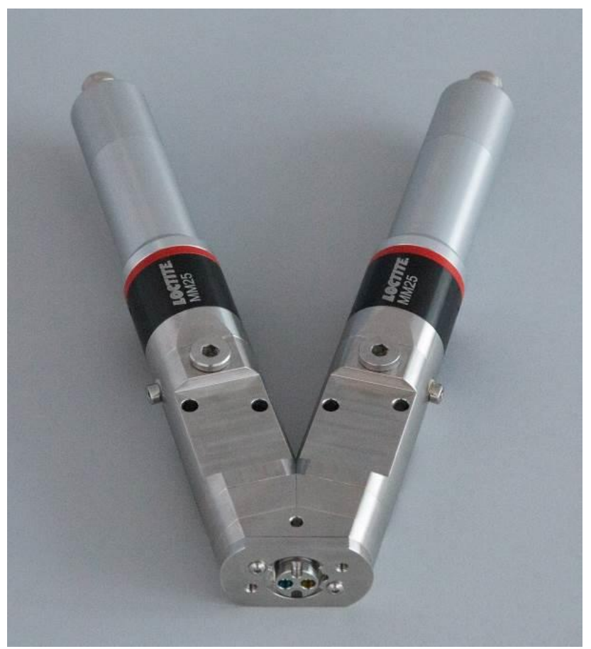
MM25 Dual Rotor Pump as close-up