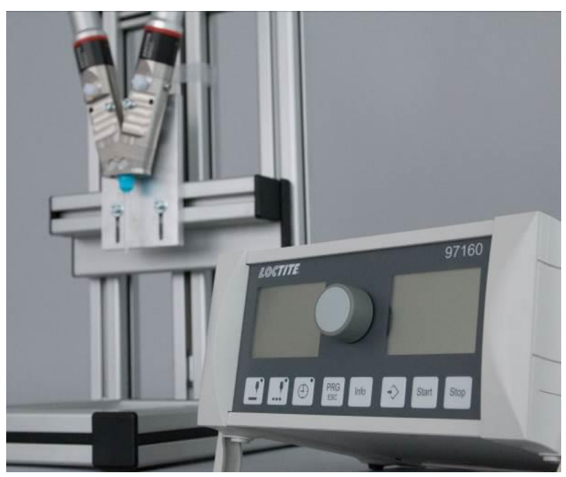
Dual rotor pump controller Loctite 97160