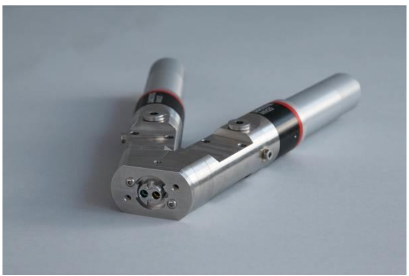
MM25 Dual Rotor Pump