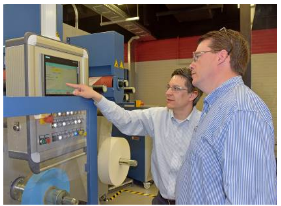
Designed to simulate the customer's process, the facility includes single and dual lamination capabilities and a wide range of adhesive application technologies.