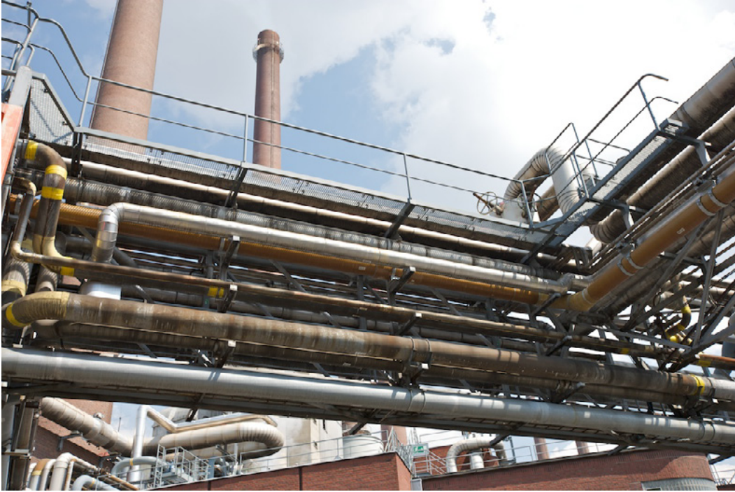
Henkel products increase pipe life time.