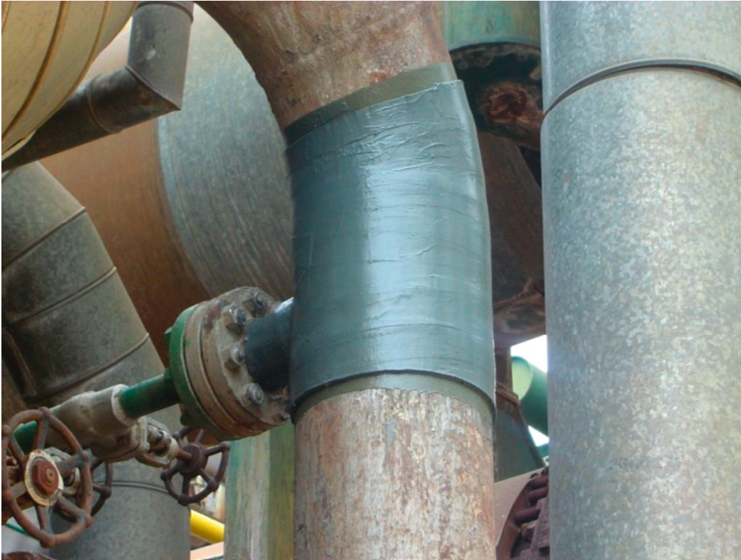
Pipe repair solution from Henkel.