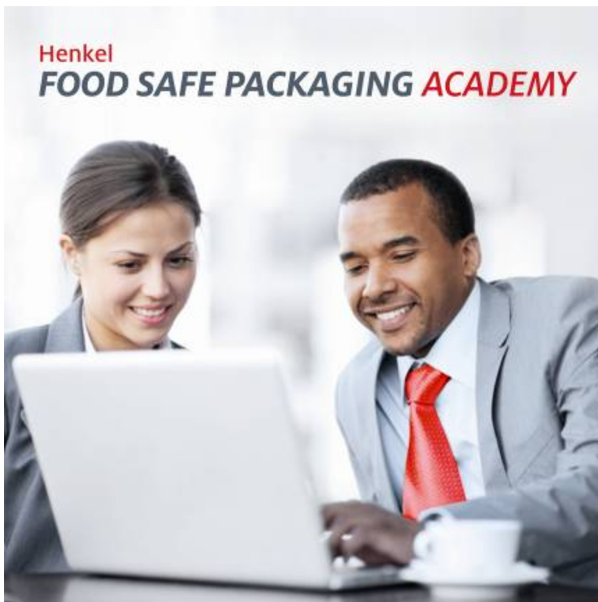
Henkel's new Food Safe Packaging Academy.