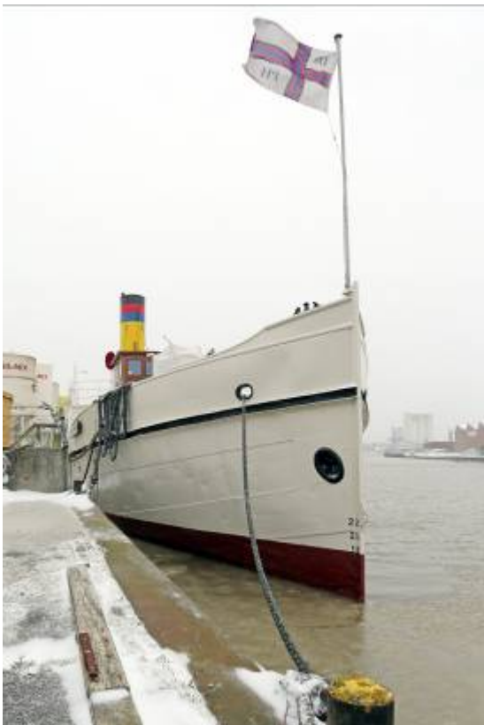
The "Prinz Heinrich" twin-screwed steamer which was built at the Meyerwerft yard in 1909.

As soon as the epoxy resin has cured, it forms a foundation that perfectly matches the contours of the machine.