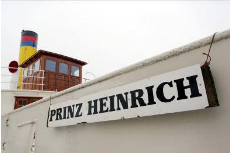
The "Prinz Heinrich" is Germany's oldest coastal steamer.