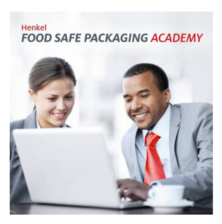
Henkel's new Food Safe Packaging Academy.