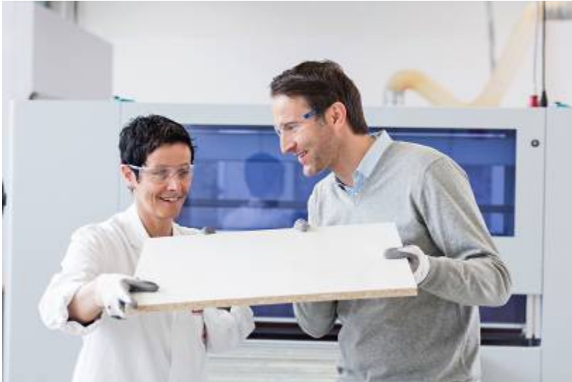
Impressive finishes with Technomelt CHS 700 / 710 reactTec.

The following images are available for publication: